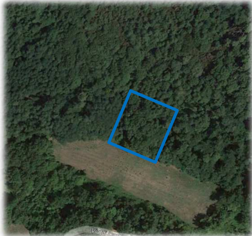
F. 23 P.LLA 279