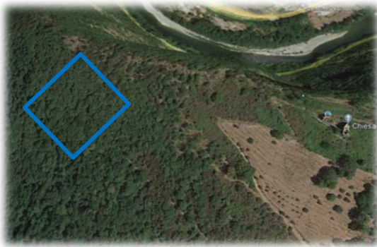
F. 23 P.LLA 290