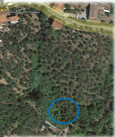
F. 24 P.LLA 242